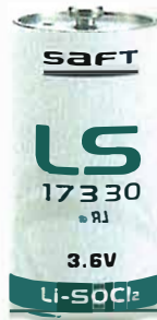
Made in UK (stop production)